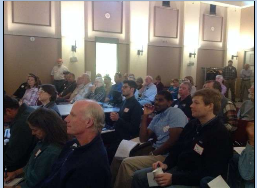
River Herring Network 4 th Annual Meeting Attendees