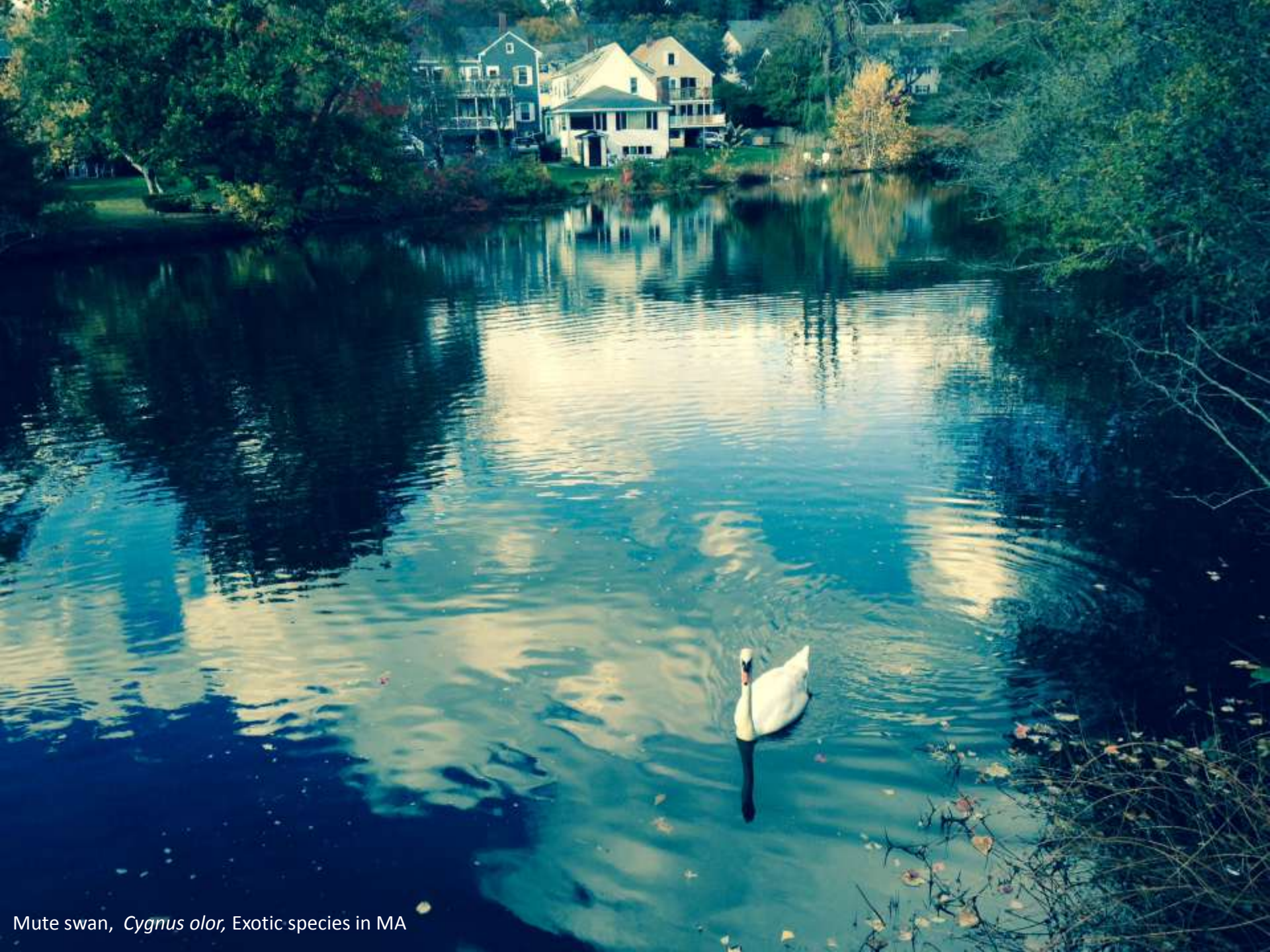
Mute swan, Cygnus olor , Exotic species in MA