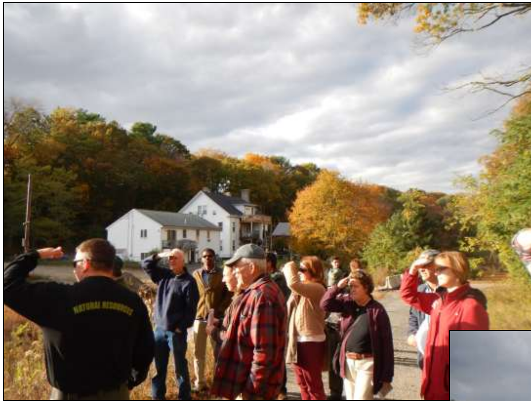
Site of the former Plymco Building