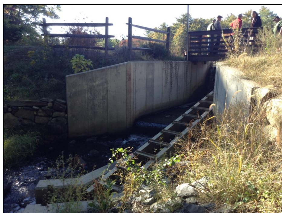
Morning Field Trip to Points Along Pembroke's Herring Run